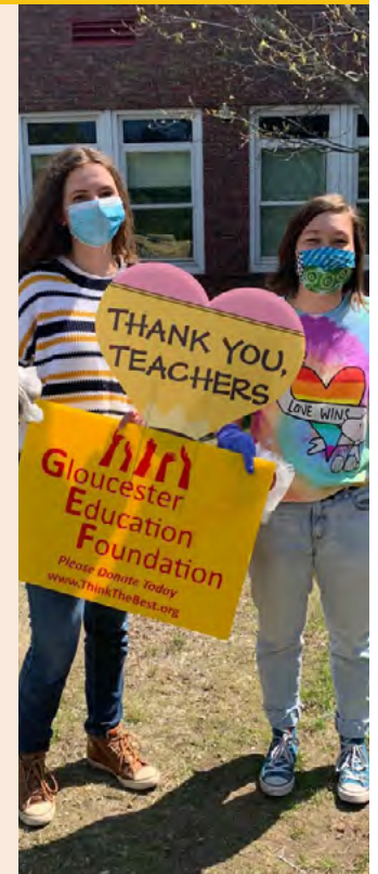
TOP LEFT: Students from O'Maley Middle School participating in the Remote Learning Center program, a partnership among the YMCA, GEF and Gloucester Public Schools.

to our teachers, administrators, and school staff for going above and beyond the call of duty this year. Your continued innovation in the classroom, and your heartfelt dedication to our students kept the kids learning and engaged all year long. In this year of incredibly difficult circumstances, Gloucester Public Schools staff rose to the occasion and overcame every challenge thrown their way. We are so proud of your work and humbled by your commitment. Thank you.