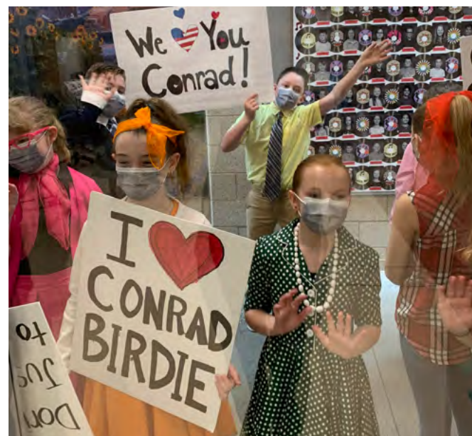
Fifth graders from West Parish Elementary perform Bye Bye Birdie .